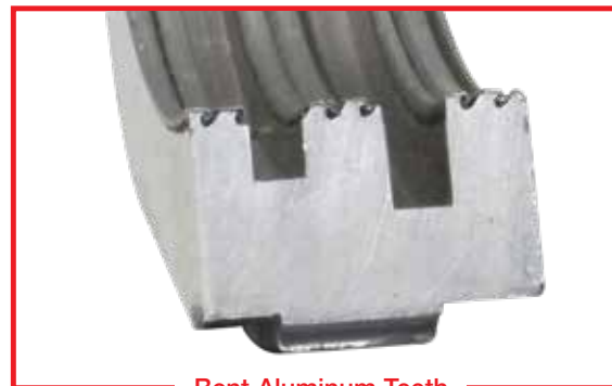
Bent Aluminum Teeth