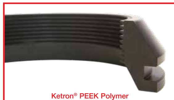
Ketron® PEEK Polymer Labyrinth Seals