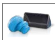
Impact blocks Loading buckets